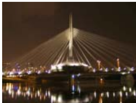
A great night for taking photos !