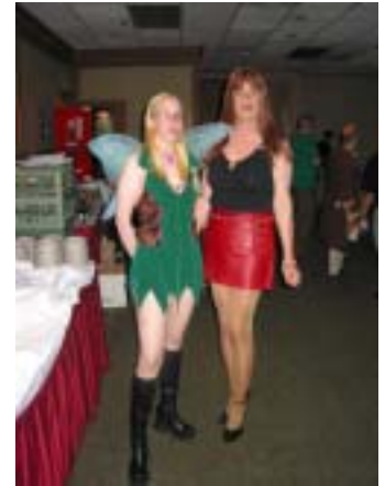
My daughter and I

Meeting up with friends I've gotten to know from the previous KeyCon's