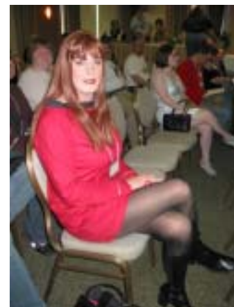
Me in the audience!