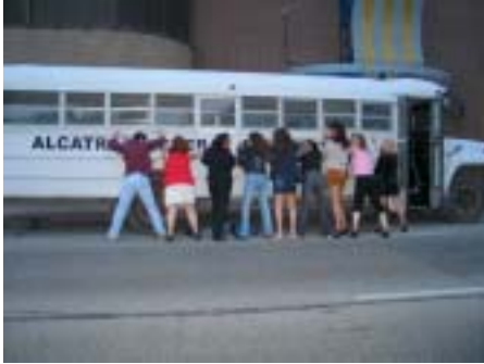
Some fun outside Gio's with some new friends!