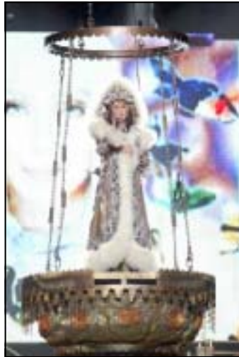
Cher! The Diva herself!