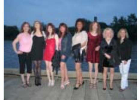
Posing for a photo on the dock!