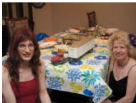
A special gift for a special Mom!!