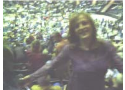
Me & The crowd!