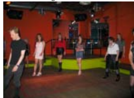
Now we're getting it!