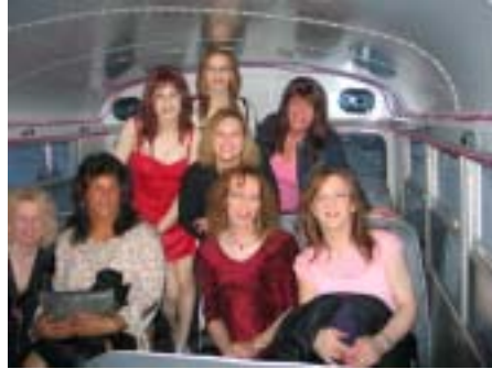
The girls on the bus!