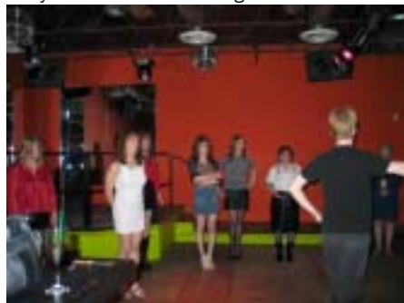
Raven teaches the basics.