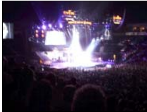
The Stage as seen from our seats!