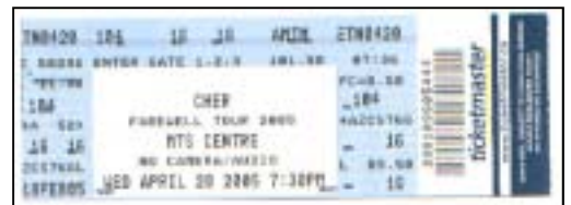
My ticket stub!