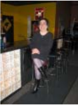
A happy girl!

"Rhiannon", is the title of a Fleetwood Mac song