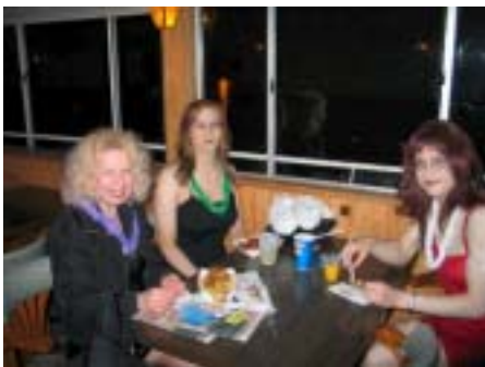
An on board snack before dancing!